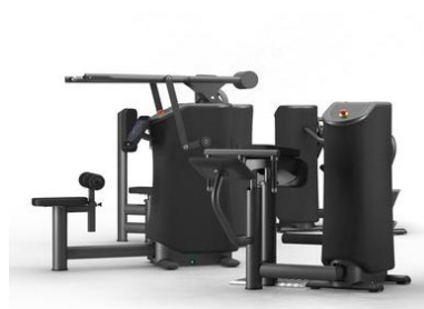
Some of the training Machine