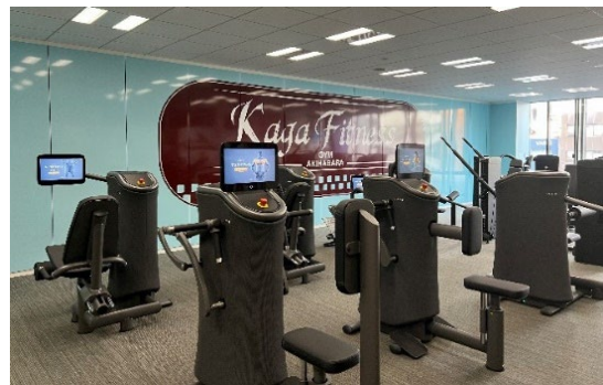
The gym opened in the Company’s head office in Akihabara, Tokyo

The Company has continued to allow teleworking even after the COVID-19 pandemic, with an office attendance rate of 40-60%, and has also expanded workplaces in which employees are free to change desks. This has resulted in surplus office space, which the Company is now effectively utilizing as a gym. Since the gym is located in the Company’s own building, employees can use it whenever they have free time, even during working hours, and take on their duties feeling refreshed and recharged. The gym is also widely available to employees who do not work at the head office, so they are free to use it when visiting the head office for business or after working hours.